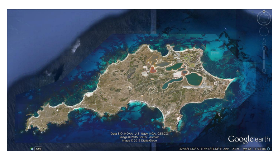
Fig 1. Location: Rottnest Island