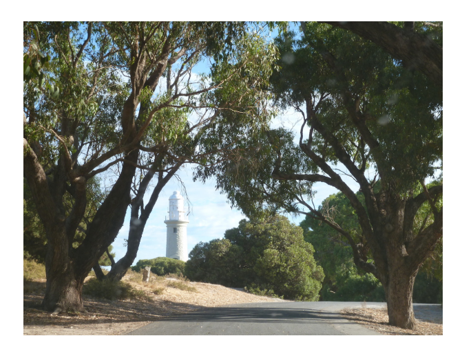
Fig 4. Lighthouse, Bathurst Point viewed from planted avenue, Thompson Bay settlement, Rottnest Island

For most travellers to Australia in the 19th and the first half of the 20th centuries, Rottnest Island/Wadjemup was the first sight of land and many anchored off the Island waiting to be piloted into Fremantle port. It was also the last sight of land for those who travelled back 'Home' (to Britain) or left for the wars in Africa, Europe and Asia on Navy ships.