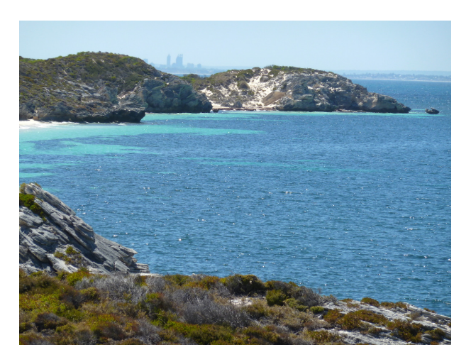
Fig 5. City of Perth skyline viewed from south east coast of Rottnest Island

Aesthetic qualities continue to capture the imagination and the beauty of the cultural landscape of Rottnest has long held fascinated artists (Vizents, 2014; Snell, 1998). The Island is tantalizingly close to the mainland and has exerted a strong attraction to mainlanders because of its sense of place.