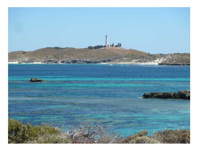
Fig 2. Lighthouse on Wadjemup Hill, Rottnest Island